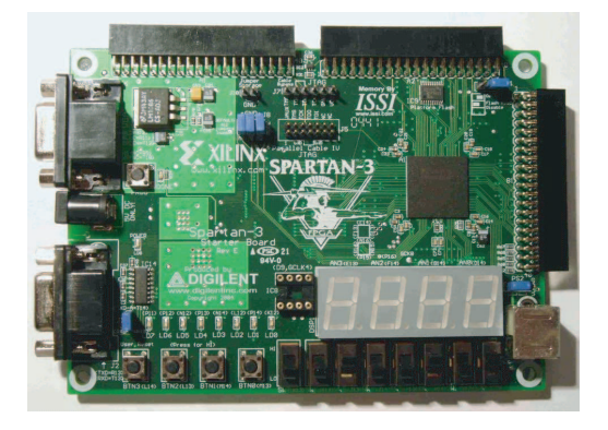
Fig. 2. The Spartan-3 Starter Kit board used in the lab exercises.

As seen from the lecture plan, we included a number of new features becoming available including Intellectual Property (IP) cores, high speed I/O and run-time reconfigurable computing. These will probably expand their applicability in the future. The course also tried to teach the students to be able to make technological choices. This is relevant for e.g. IP cores; there are both benefits and drawbacks of applying available IP cores. It can substantially speed up the design work but it may be expensive, and quality of documentation is important if modifications are needed. Another issue is migration and selecting between ASIC and FPGA which involves a number of critical considerations.