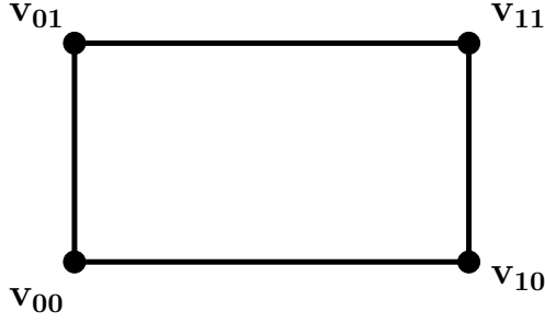
FIG. 2.2. Notation for the hyper-rectangle case in d = 2 : \mathbf{v}_{00} = (a_1, a_2) , \mathbf{v}_{10} = (b_1, a_2) , \mathbf{v}_{01} = (a_1, b_2) , \mathbf{v}_{11} = (a_2, b_2) .

2.2. Hyper-rectangles. We can also improve the upper bound in the case of a hyper-rectangle, i.e.